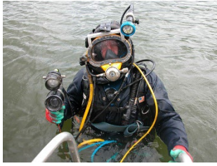
Diver at work